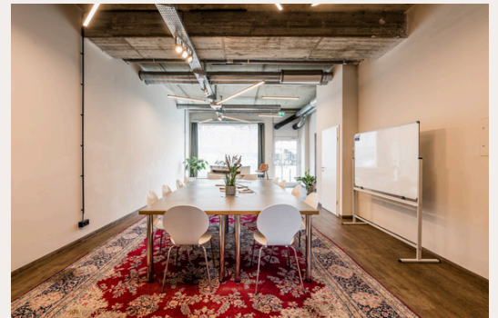
Bookable workshop spaces

Our office interior designers and specialists design spaces that create room for creativity and innovation. We carefully translate your corporate identity into your corporate interior – from consultation and conceptualisation to construction.